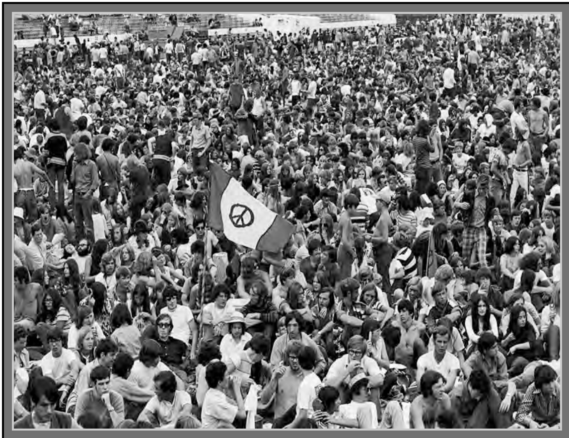
Man-Pop Festival, Winnipeg, Manitoba, 29 August 1972

Presented in conjunction with the 8 th Annual Global Health Form, this exhibition aims to explore the different modes of social responsibility in our society today; the relevance of social responsibility to global health as well as the role art can play within social responsibility. Stone Lobby Student Curators (SLSC) is a student group at the University of Toronto that collaborates with the Centre for International Health (CIH) to organize art events on campus addressing global issues throughout the year with the intention of exploring the links between the Arts and Sciences.